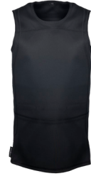
GENDER NEUTRAL FIT